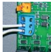
Figure 2. AquaLink RS or Remote TSTAT Connection (2-Wire Connection)