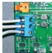
Figure 1. Remote Pool-Off-Spa Connection (3-Wire Connection)